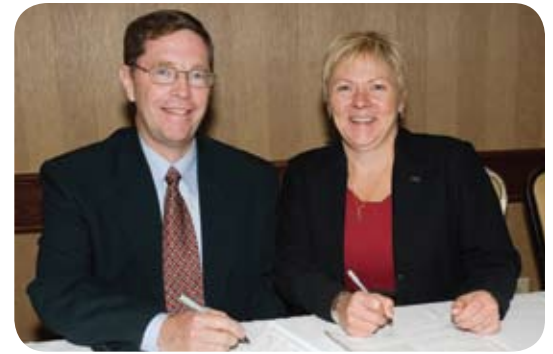
Signing of protocol at 2008 UBCM Convention

Already, these initiatives have brought funding and resources into BC communities, enabling members to develop policies, programs and plans to create healthier communities.