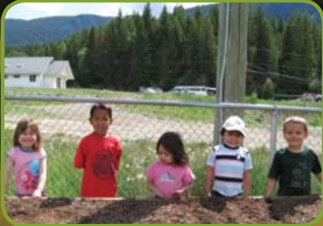
Community Garden Seeds for Simpcw First Nation

Healthy communities create opportunities for its residents to stay active, eat healthy and connect with one another