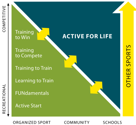
Long Term Athlete Development

An early active start enhances development of brain function, coordination, social skills, gross motor skills, emotions, leadership, and imagination.