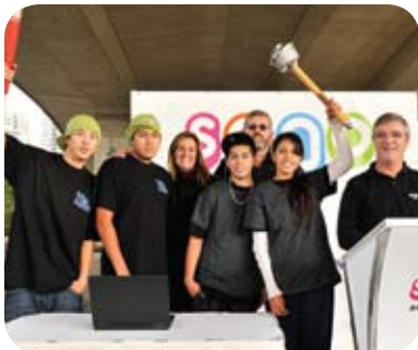
Sogo Active Launch Event

We continue to build upon our relationships with other organizations.