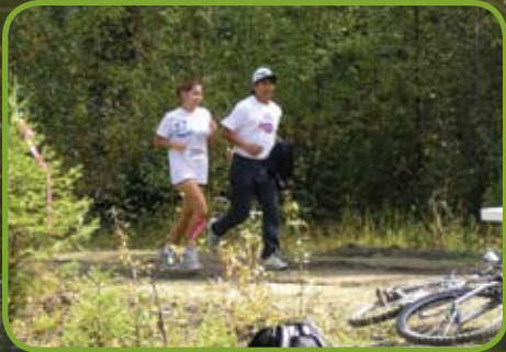
Canim Lake Band active event

Strong leadership skills of professionals and volunteers produce effective parks and recreation services