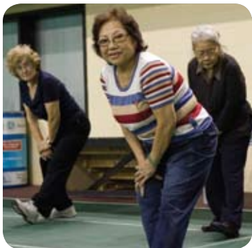
Older Adults get active

BC Healthy Living Alliance, Winning Legacy, 2005