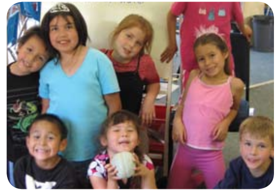
Simpcw First Nation

Enhancing quality of life for people in BC communities.