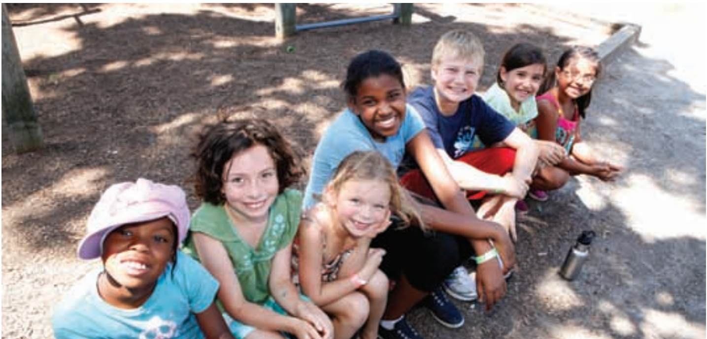
HIGH FIVE® A quality standard for children's sport and recreation Founded by Parks and Recreation Ontario