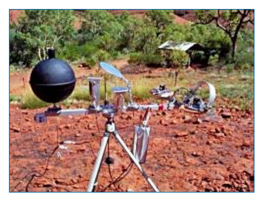
Wet bulb globe thermometer

The Wet Bulb Globe Thermometer (WBGT) measures the effect of heat on the body's core temperature. It does this by combining the effects of radiant heat sources like the sun and heaters, with the ambient temperature and prevailing humidity. The WBGT also notes any air movement that would aid evaporation of moisture from the skin, a natural cooling mechanism.