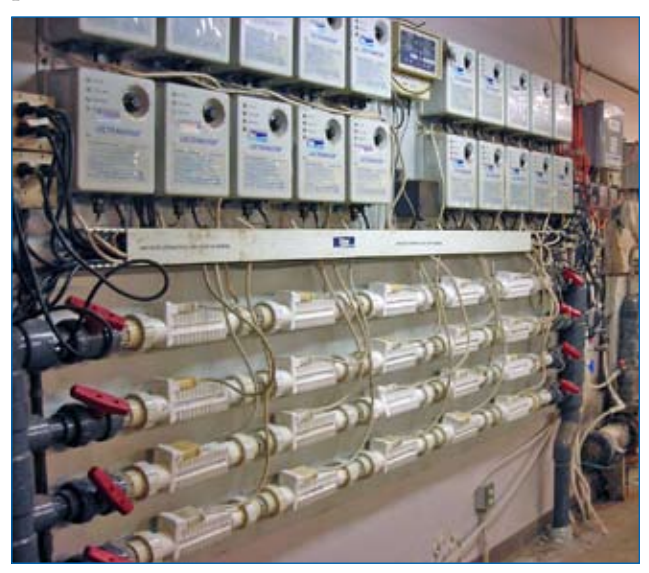
Electrolytic chlorine generators

In salt 'chlorination,' chlorine is generated when pool water with adequate salt content passes through a series of units containing electrically charged metal fins as part of the pool circulation system. The amount of chlorine generated is controlled by the operator and is water-based causing no potential for a leak. However, another salt-based system of generating chlorine does so in an open tank with accompanying hazards and the need for personal protective system. At this time, this system has not been used in a public pool in BC.