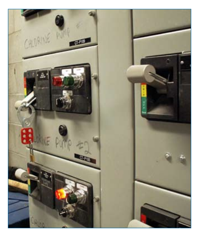
Never work, even for a second, on equipment that has not been locked out.