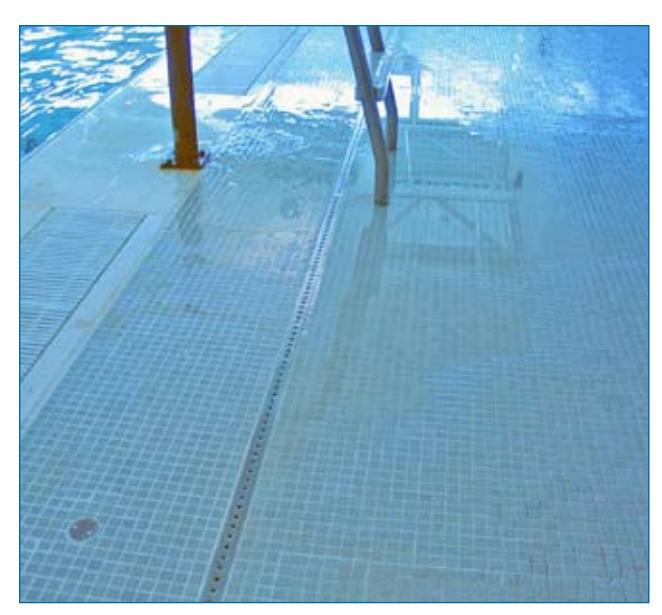
Example of standing water

The maximum water turnover time is 6 hours for the main pool and 2 hours for the leisure pool. The maximum turnover time for whirlpools is 1 hour.