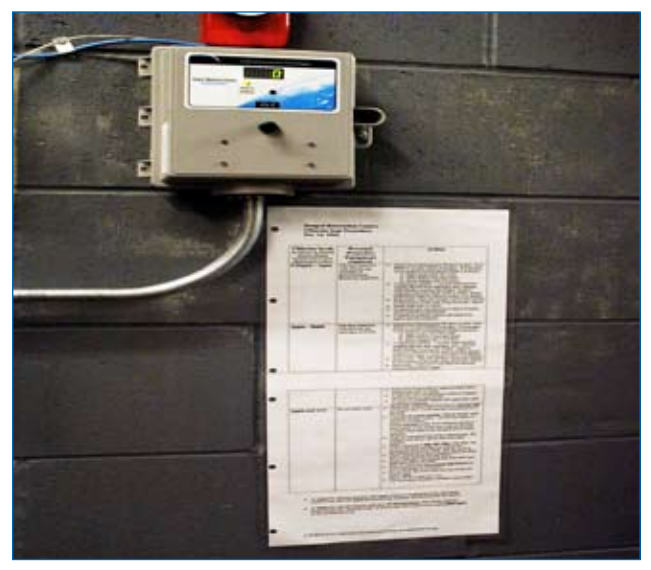
Chlorine alarm and emergency procedure

safely exhausting the leaked gas to outside (not exhausted directly into the ventilation system of the pool, for instance).