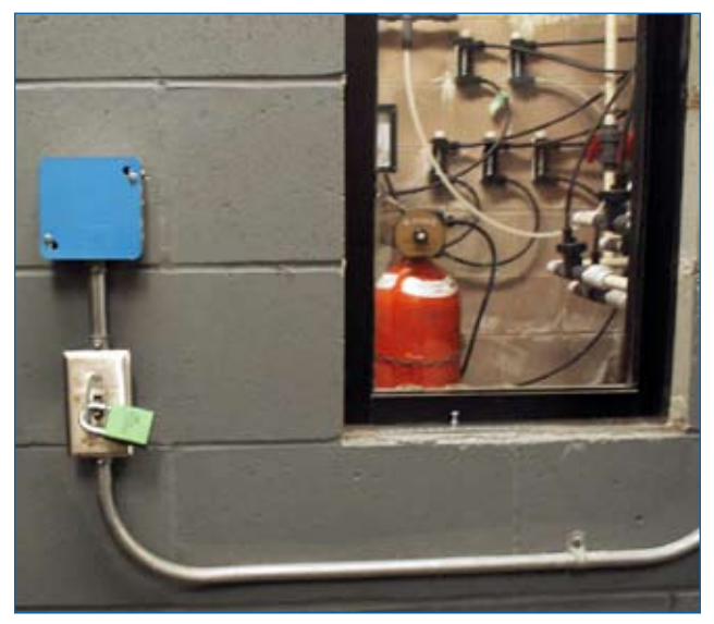
Chlorine gas room through viewing window

Twenty-four hour monitoring is mandatory. The monitor must be able to set off an audible and visible alarm to alert workers to a release of chlorine or ozone. The monitor must be calibrated at least annually. While calibration is being done, the workplace must still be protected, so if at all possible, the calibration should be done on-site.