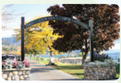
Beach Avenue Project District of Peachland