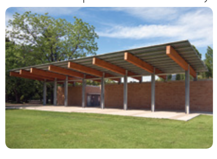
Parks and Open Spaces Award Willoughby Community Park Township of Langley