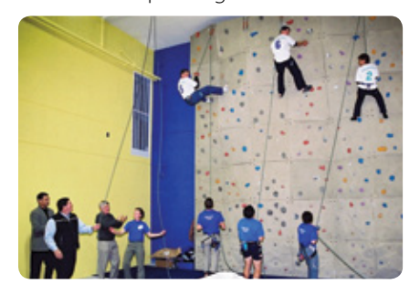
Facility Excellence Award Native Sons Hall | City of Courtenay