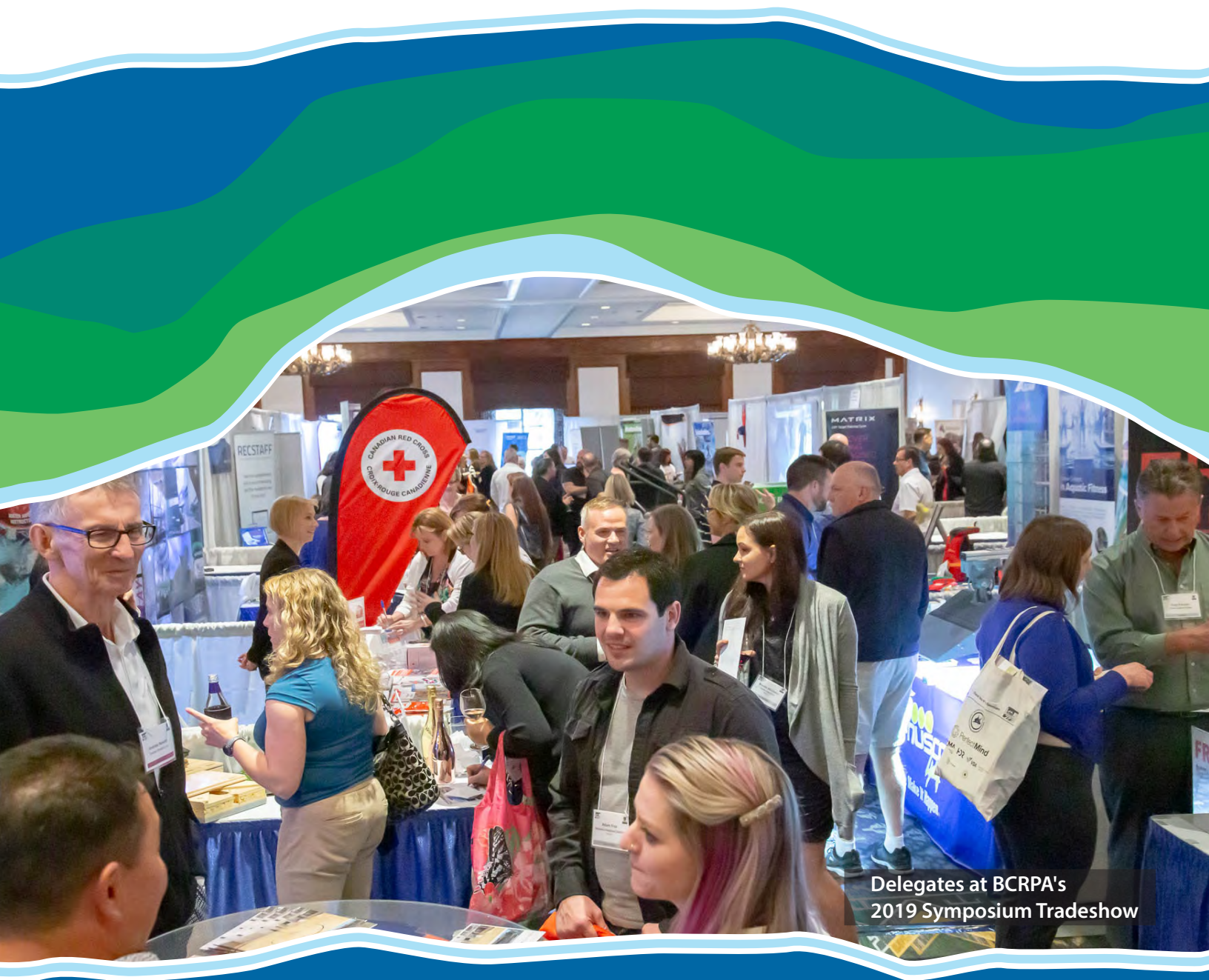
Delegates at BCRPA's 2019 Symposium Tradeshow