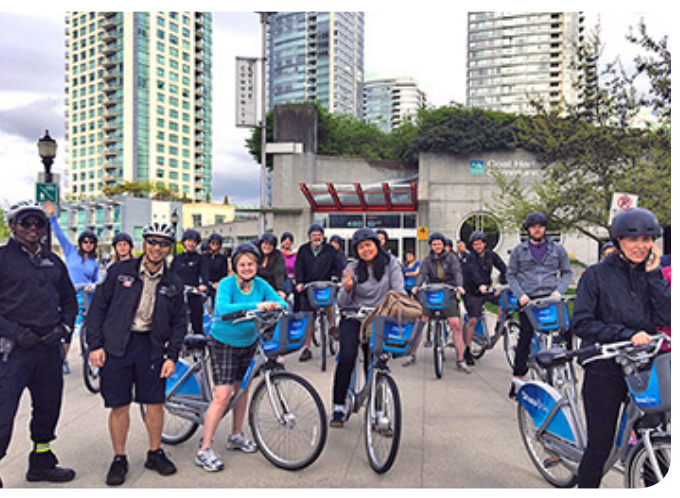
Members on the move at Symposium

We kicked 2019 off with our annual membership drive which saw more members than ever before join BCRPA! We were also thrilled to welcome back a number of Local Governments from across various corners of the province whose enrollments had lapsed in previous years. This is a testament to the renewed faith and growing recognition of the significant value BCRPA membership provides, and our deep commitment to serving our members.